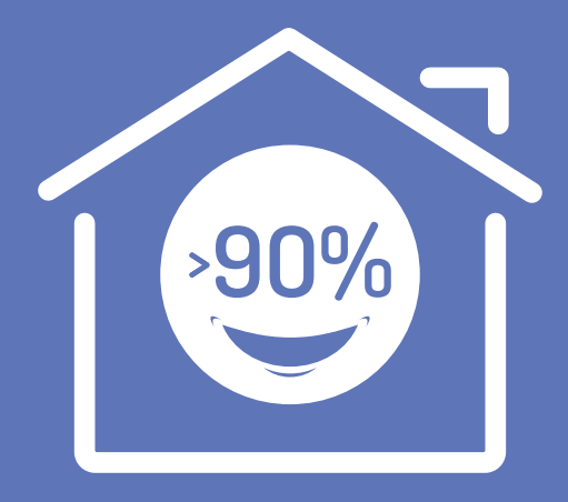
More than 90 per cent of mortgage broker customers are happy with their mortgage broker's performance

A Mortgage Broking Industry Group report by Deloitte Access Economics